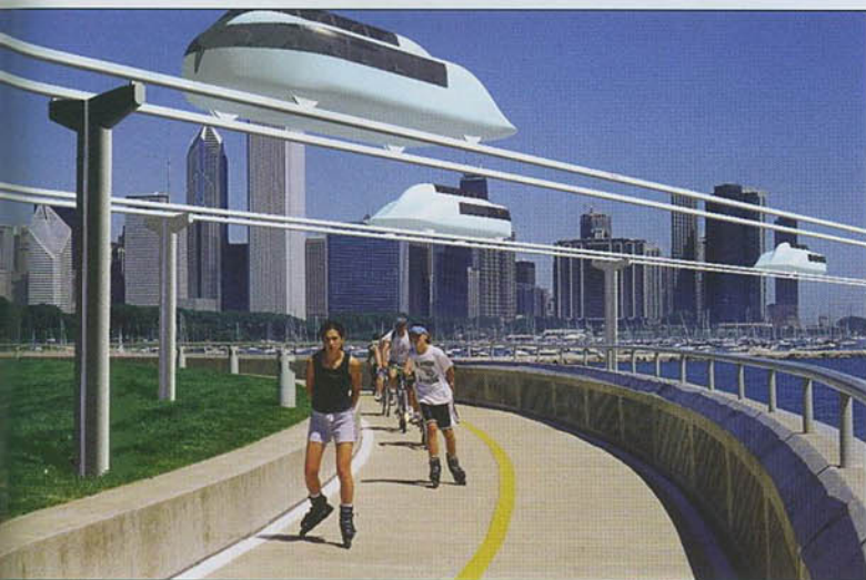
String Transport or Unitsky String Transport is an altitude high-speed freight/passenger rail transportation system designed by Russian inventor Anatoly Unitsky ( www.wikipedia.org )

Moscow, Nizhny Novgorod, Yekaterinburg, Novosibirsk, Khabarovsk and other Russian cities. This technology would make it possible to save huge amounts of fuel – a very topical issue today – as the world's oil supplies would run out before the end of the string rail network's service life. The fuel savings would be considerable: if 100,000 people on average travelled along the trans-continental STU network every day, over the 100 years of its service life, the fuel savings compared to air travel of the same volume and following the same routes would come to more than two billion tons and would represent a value of two trillion euros.