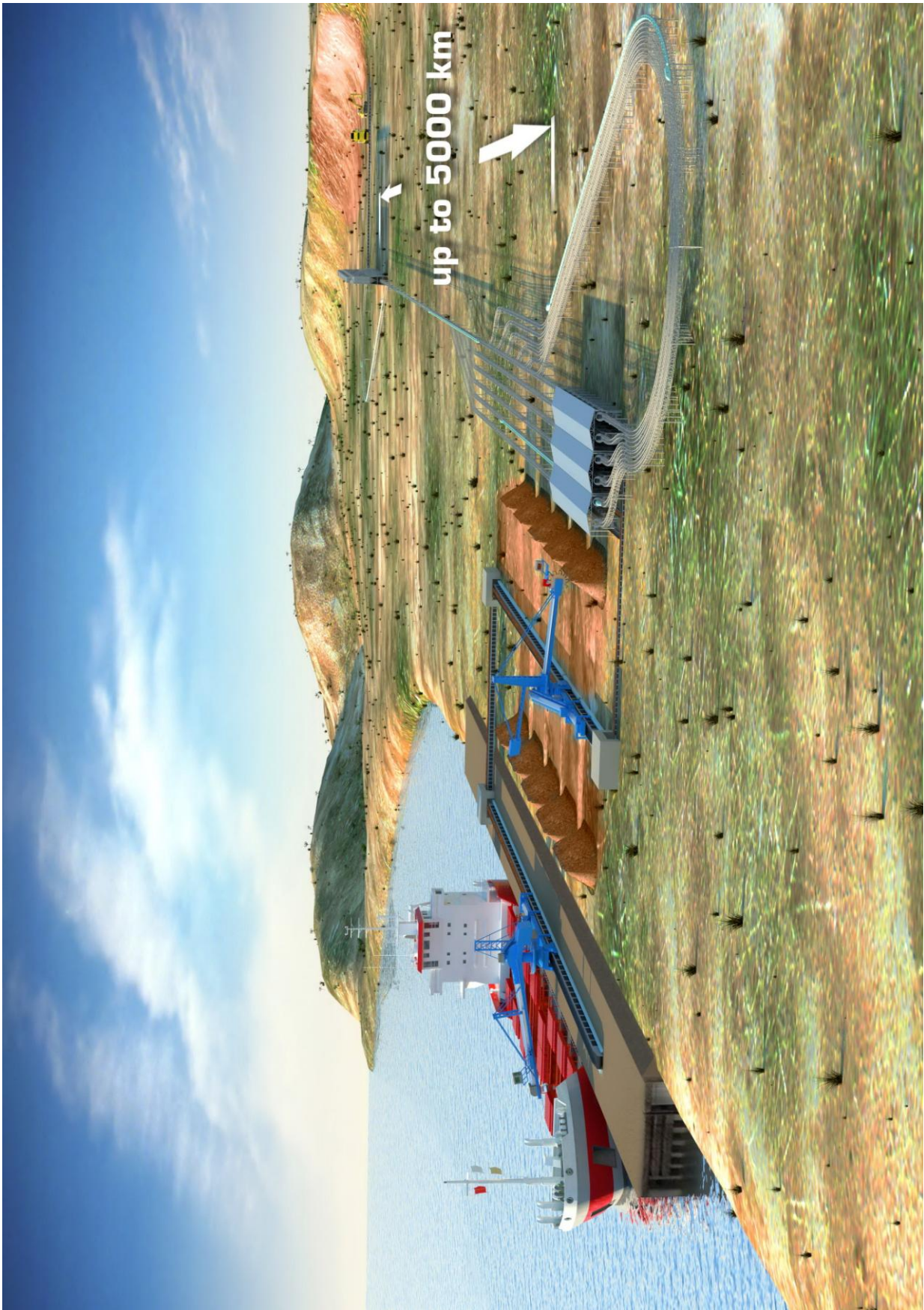
Fig. 2. STS 103 Transport system