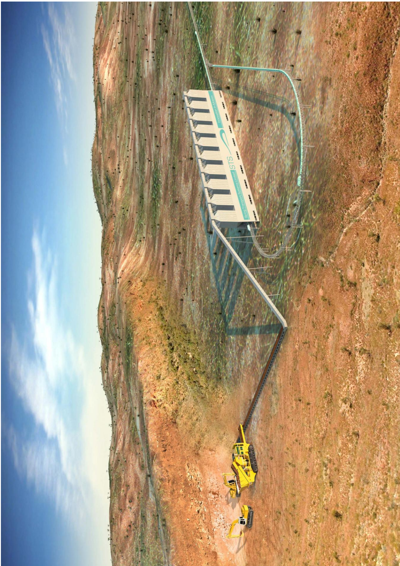
Fig. 3. STS 103 Transport system – loading of ore to the trains