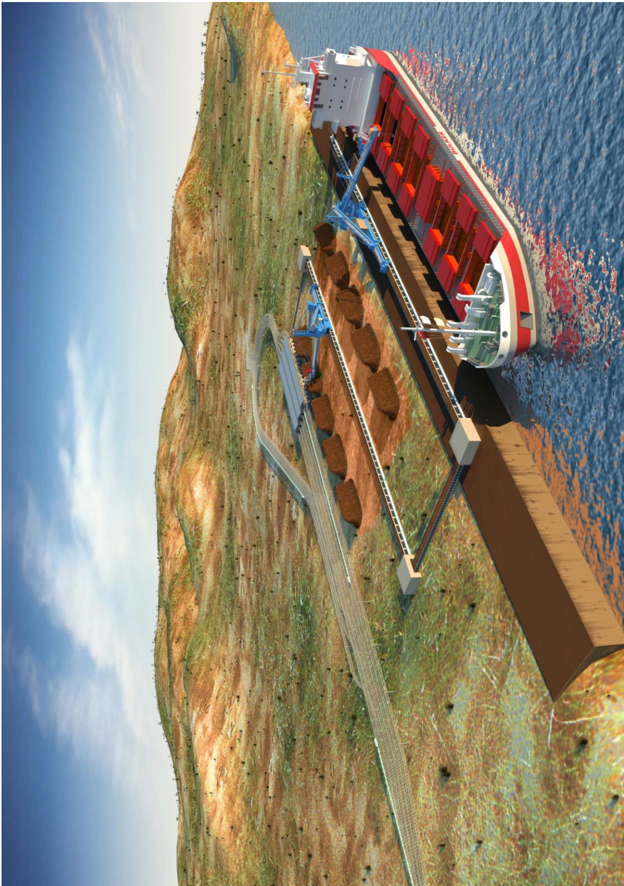
Fig. 4. STS 103 Transport system – unloading of ore in the sea port