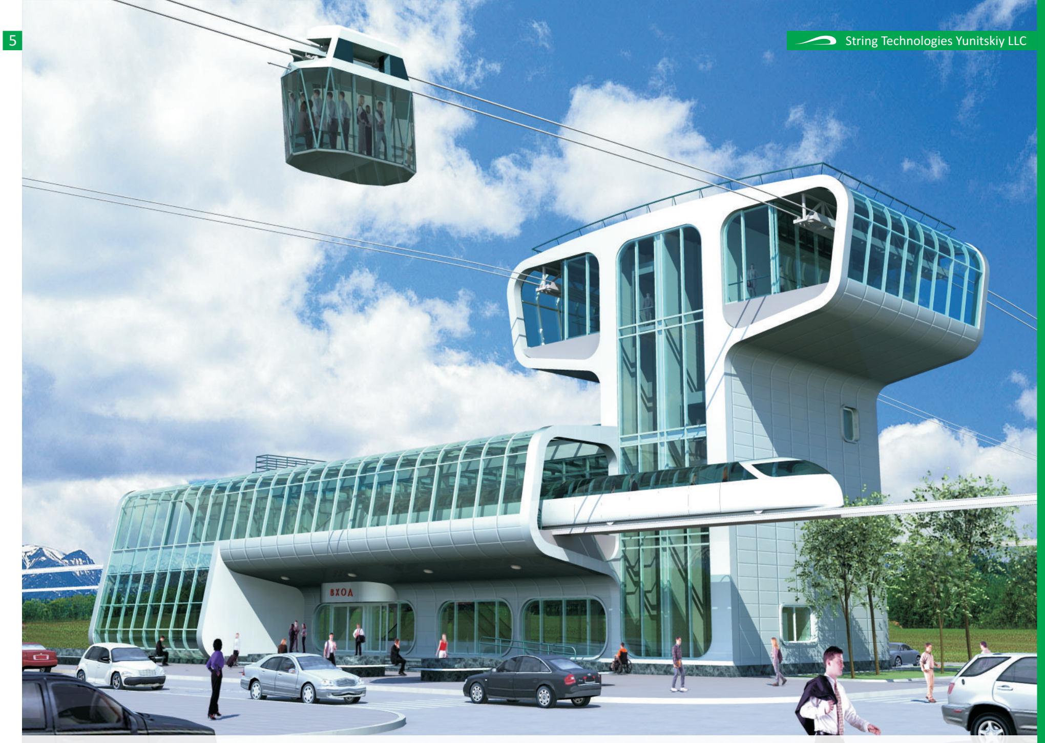
Changing station to change from the inter-city STY route to the city STY route